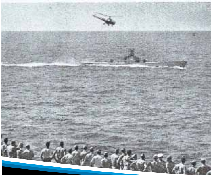
HO3S-1 (S-51) Preparing To Make A Delivery To The Submarine Greenfish.