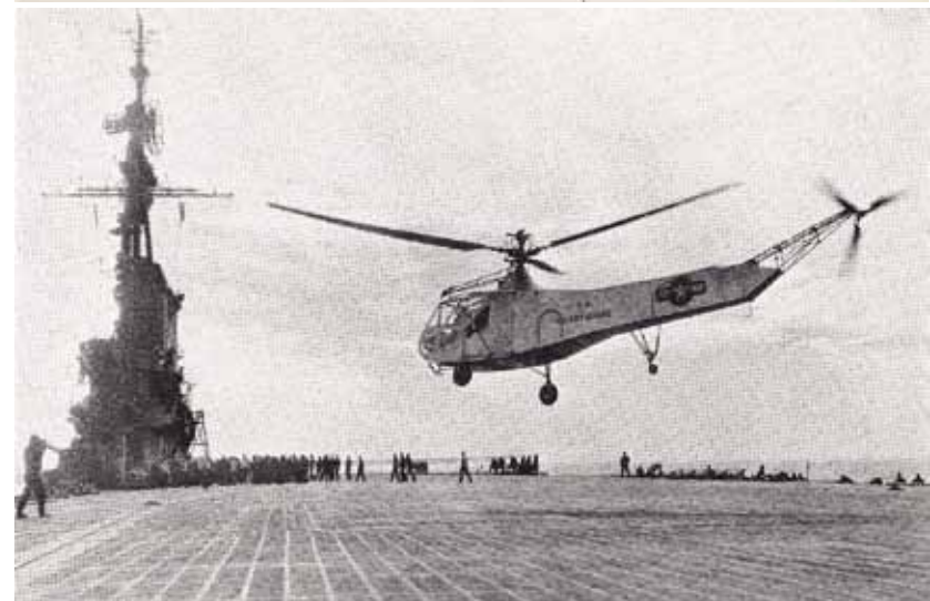
The R-4 on left with floats is shown taking off from a tanker at sea and another R-4 landing on the U.S.S. Midway’s flight deck at right