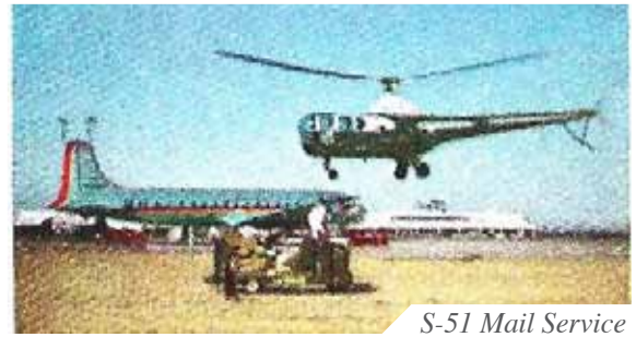
S-51 Mail Service

New England's first airmail flight was recorded back in 1926. Twenty years later, the S-51 delivered the mail from airport to post office doors. The Sikorsky helicopters were used in Bridgeport and New Haven, Connecticut, Portsmouth, New Hampshire, and in Worcester, Massachusetts.