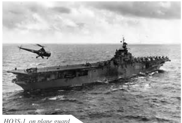
HO3S-1 on plane guard

The first Naval Helicopter Training School was set up at the Blimp Training Facility in Lakehurst, New Jersey. Sikorsky helicopters shared the facility and air space with blimps, which was a unique combination.