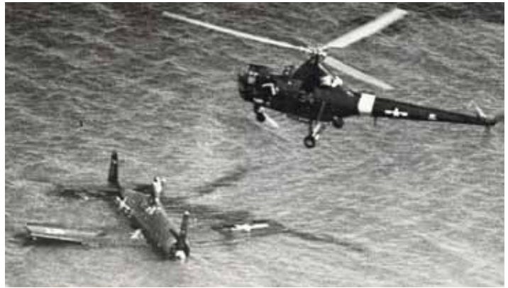
HO3S-1 rescuing downed pilot before his feet get wet

The S-51 (HO3S-1) was selected for the Navy’s primary aircraft carrier helicopter support mission. 229 aircraft were built for this mission.