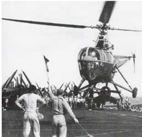
The Landing Signal Officer directs an S-51 (HO3S-1) Helicopter Landing On The FDR