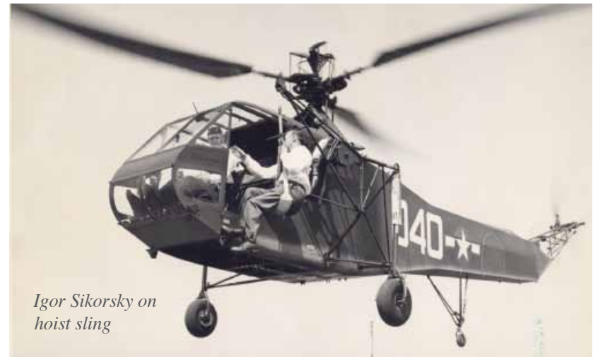
Igor Sikorsky on hoist sling

During the early 1940s, Sikorsky Aircraft received a contract from the U.S. Army for the R-4, the first production helicopter for the U.S. Military. A total of 135 were built including 8 for Great Britain.