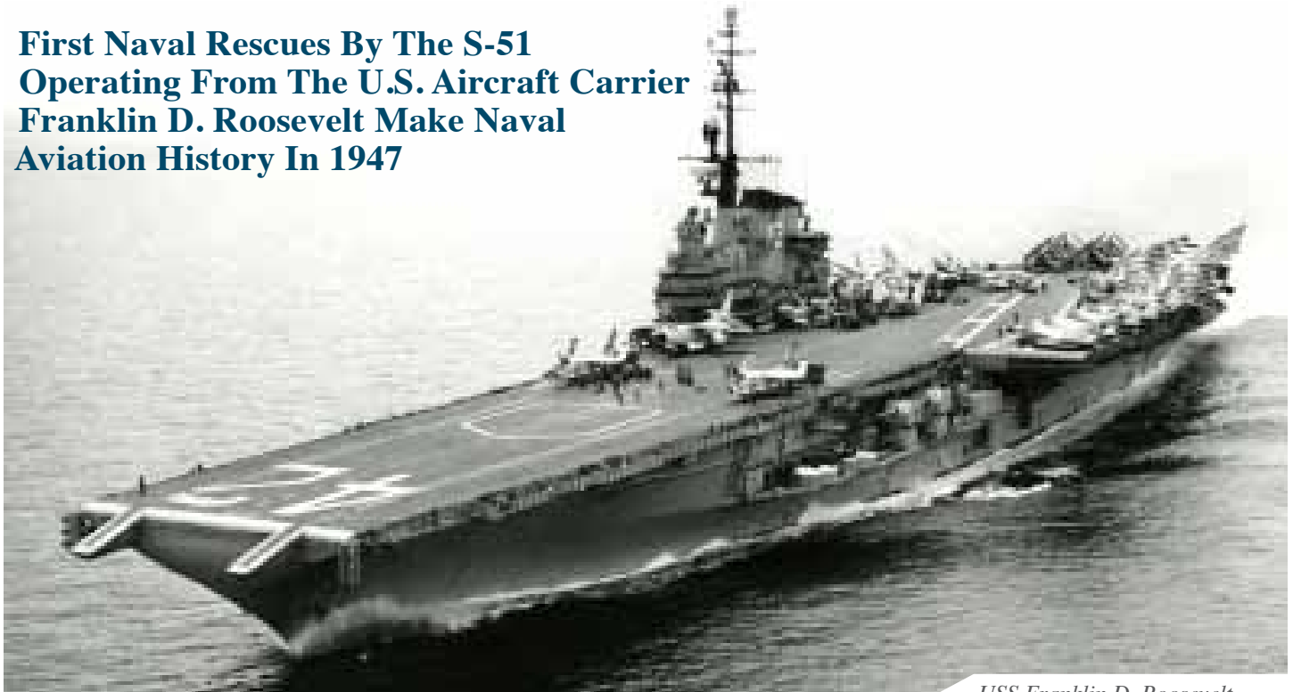
USS Franklin D. Roosevelt