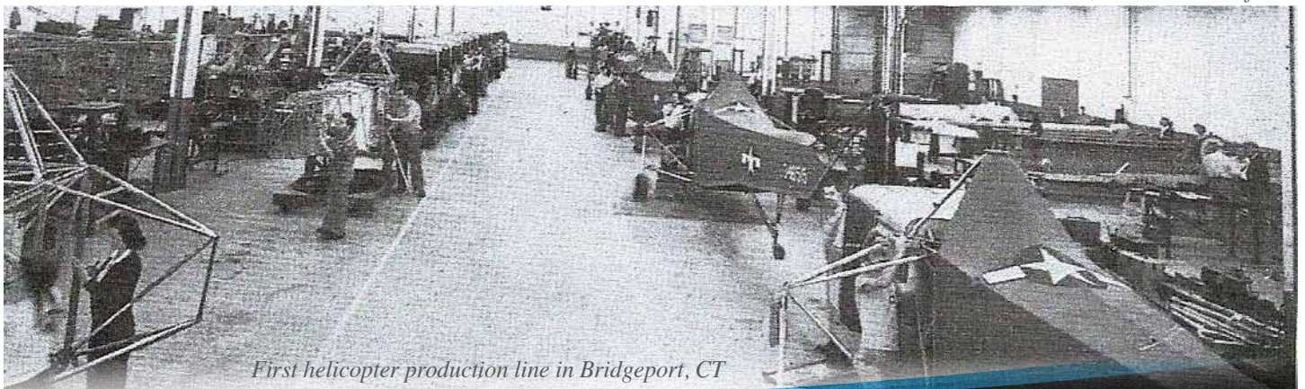
First helicopter production line in Bridgeport, CT