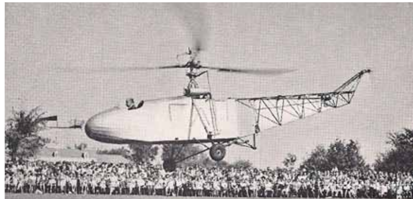
Last Flight Of The VS-300

During the early 1940s, Sikorsky Aircraft received a contract from the U.S. Army for the R-4, the first production helicopter for the U.S. Military. A total of 135 were built including 8 for Great Britain.