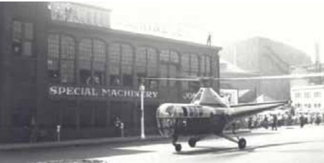
S-51 Mail Service in Bridgeport, Connecticut