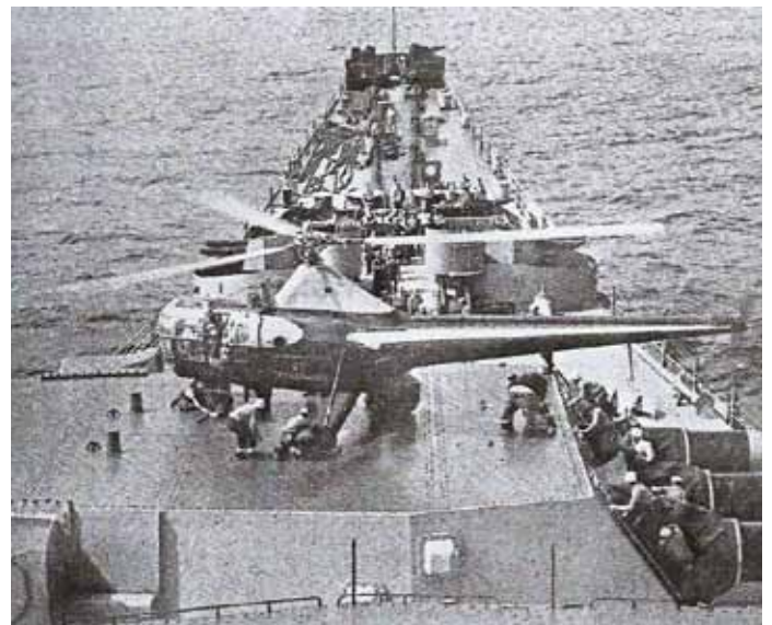
S-51 lands on the forward gun turret of the battleship Missouri