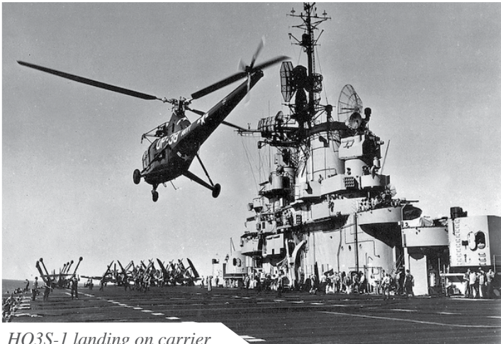
HO3S-1 landing on carrier