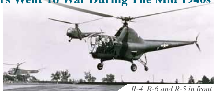
R-4, R-6 and R-5 in front

The R-4, R-5 and R-6 were the first helicopters in the world to be put into quantity production for the U.S. Army, Navy, Coast Guard, British Royal Air Force and Royal Navy. The R-4 and R-5 were built by Sikorsky and the R-6 were built by Nash-Kelvinator to Sikorsky designs. 🇺🇸