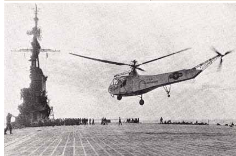
The R-4 on left with floats is shown taking off from a tanker at sea and another R-4 landing on the U.S.S. Midway's flight deck at right