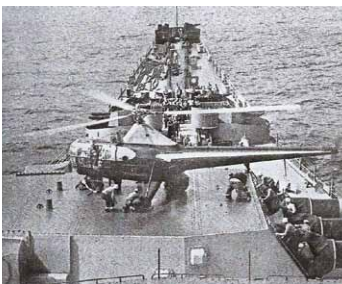
S-51 lands on the forward gun turret of the battleship Missouri