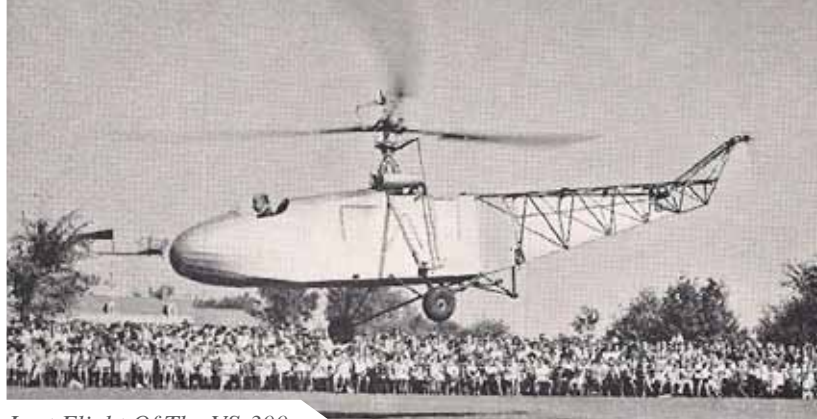
Last Flight Of The VS-300

During the early 1940s, Sikorsky Aircraft received a contract from the U.S. Army for the R-4, the first production helicopter for the U.S. Military. A total of 135 were built including 8 for Great Britain.